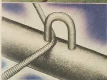
All Hills Hoists have these round steel staples welded to the arms to hold the clothes lines. These will not cut or chafe the wire.