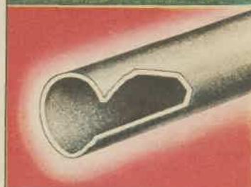
The genuine steel tubing of 'Supa' stays, and arms of all Hills Hoists, give greatest strength. Light-weight steel tubing saves work in winding-up.

Hills Hoists are so honestly 'built' that nearly 500,000 householders in Australia have installed Hills Hoists. This is nearly ten times as many as all other hoists combined — overwhelming proof that the public recognise the outstanding quality that is built into every Hills Hoist. The Hills Hoist you buy anywhere in the world is guaranteed for your lifetime.