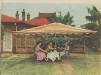
Hills 'Supa' Hoist has been built for greatest strength. The 'Supa' model is the only Hoist specially designed to carry a canvas canopy with safety.