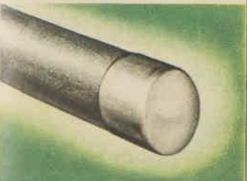
All Hills Hoists have these special bright aluminium protective caps on the ends of the arms. These caps will remain on the Hoist for its life.