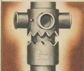
All Hills Hoists, and only Hills Hoists, have this all-round brake system and permanently rustless alloy cross-pieces to hold the arms.